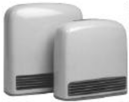
RCE329P & RCE229P