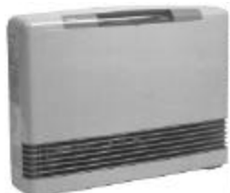
R431FP & R556FP and R431WTAP & R556WTAP