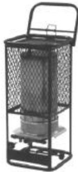
HS125LP and HS125NG