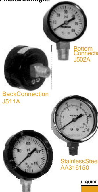
Bottom Connection J502A